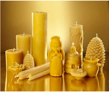
Class 79 — A Beeswax Candle