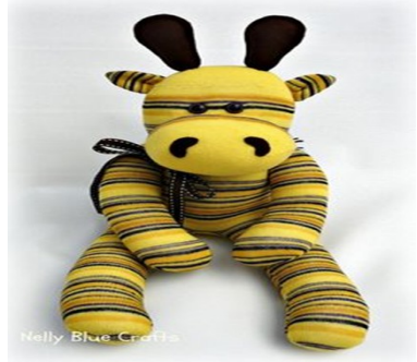
Class 44 Toy Made from socks