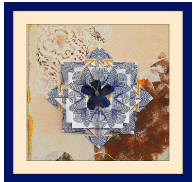
Class 49 — Card using Tea-bag folding