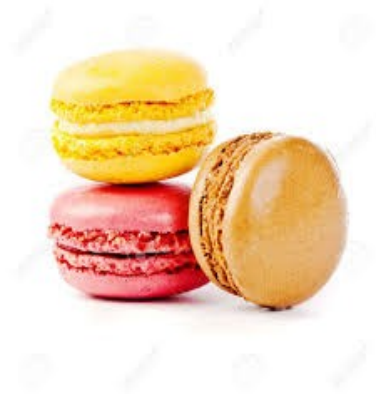
Class 13 — 3 Macarons any flavour